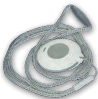
Tx radio transmitter with cord