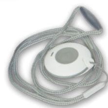
Wireless transmitter Tx with cord