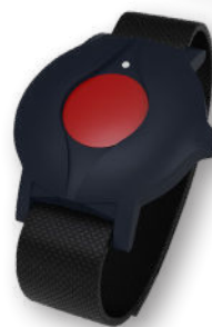
Wireless transmitter S87

The NC8 system was developed with a forward-looking vision and can effortlessly adapt to your changing needs. The expandable radio protocol and the ability to activate dementia and localization functions as required make the NC8 a long-term investment in the safety of your residents.