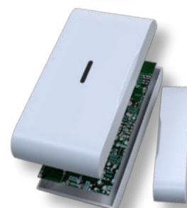
RAC80 magnetic contact detector