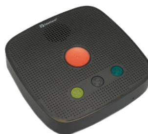
Carephone TA74 Black